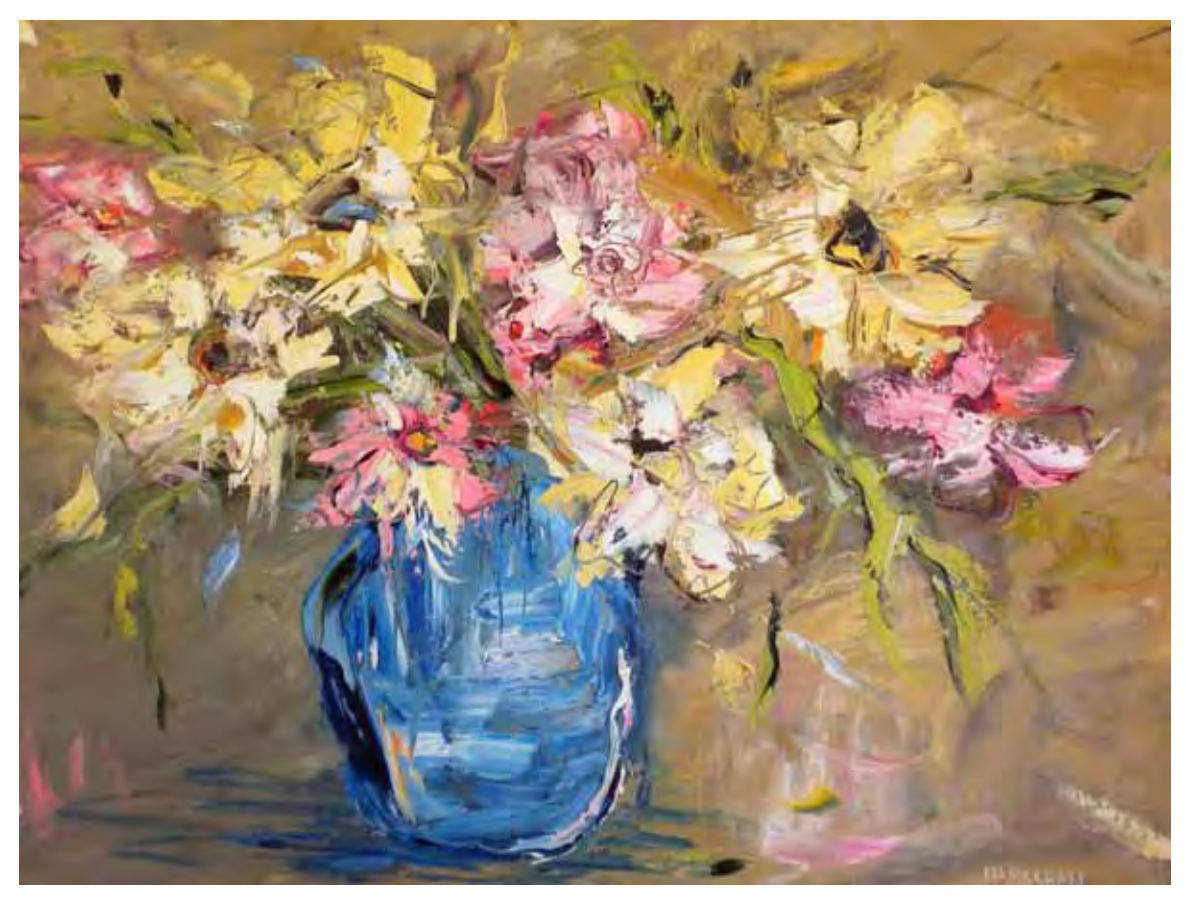
Lock Your Dreams at Night, 36" x 48"

wide range of things to enjoy and experience – museums, art galleries, theatre, concerts, and of course some wonderful dining – preferable outdoors. Yes, even when in the city, I am drawn to the outdoors."