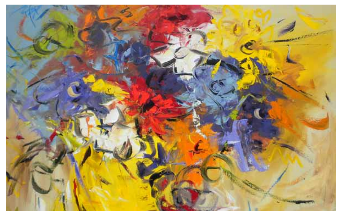
painting detail, Heart on Fire, 36" x 48", Collection of the Oxley Family, Mississauga

Gerda's studio building is 300' from the house and has twenty-foot windows on three sides letting in the light and giving an awesome view. It is surrounded by trees and gardens, and of course the river. Next to the studio's field stone patio is a magnificent 60' weeping willow that takes 3 people to hug. Its huge limbs support a swinging bench that makes a wonderful place to reflect.